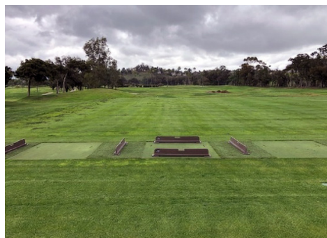
Alternating Driving Range Stalls