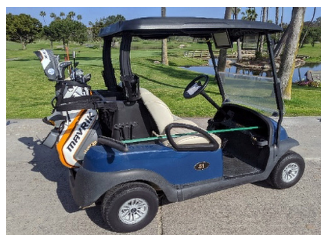
Stocked Cart: No Sand Bottles, One Rake