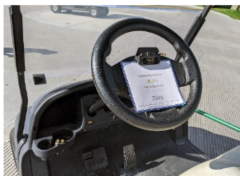
Stocked Cart: Tees, Scorecard, and Pencils