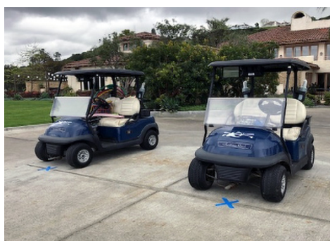
Carts Staged 7 ft. Apart