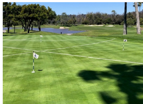
Practice Green Zones